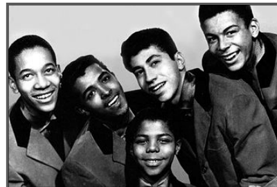
Frankie Lymon and the Teenagers